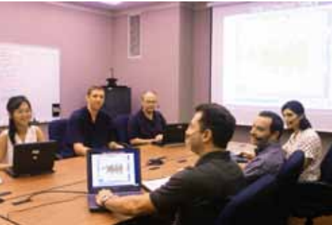
MTSFB via its respective Work Group has successfully completed its deliverables.